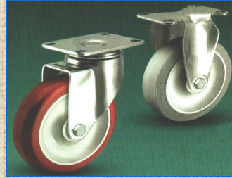
COLSON 2 SERIES STAINLESS STEEL CASTER