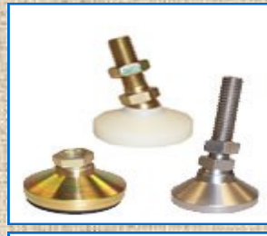
MACHINE LEVEL MOUNTS