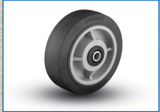
COLSON 4-7 SERIES PERFORMA RUBBER WHEEL