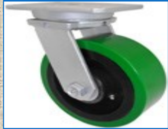
HEAVY DUTY CASTER