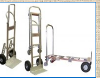
ALUMINUM HAND TRUCK