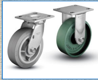
SHEPARD MEDIUM HEAVY DUTY SWIVEL & RIGID CASTER