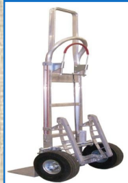
B & P BRAKE TRUCK