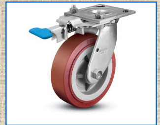
COLSON 4 SERIES FOOT LOCK SWIVEL CASTER