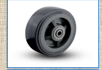
ALBION POLYURETHANE WHEEL