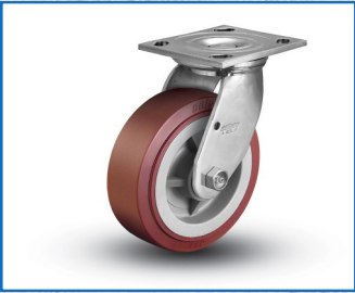
COLSON MEDIUM 4 SERIES HEAVY DUTY CASTER