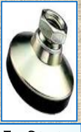
TAP STYLE LEVELER