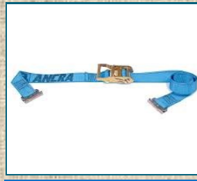
ANCR A LOGISTIC STRAP