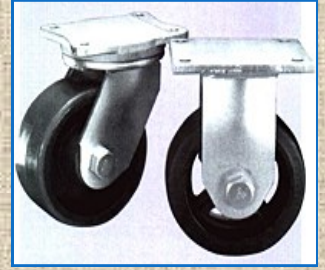
ALBION 94 SERIES SUPER DUTY CASTER