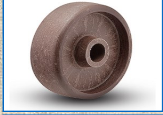
COLSON HIGH TEMP WHEEL