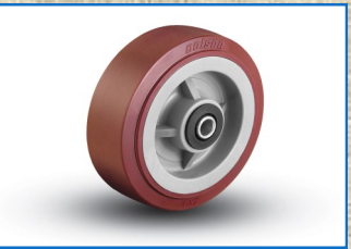
COLSON HIGH TECH POLYURETHANE WHEEL