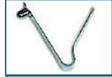
A151 Snap Button