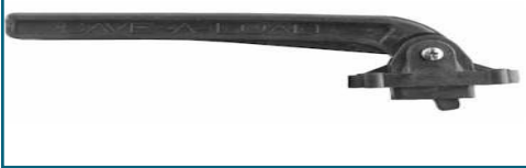
R131 Pump Handle, pin and bracket