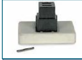
R070 Foot Assembly—Fixed