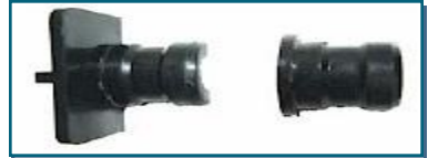
R020 End Guide