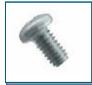
A145 Screw for Pump Handle Bracket