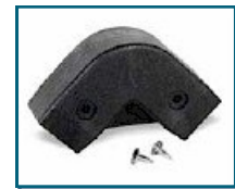
R087R Hoop Elbow Replacement Kit