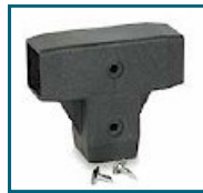
R088R Hoop Tee Replacement Kit