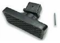
R060R Articulating Foot Assembly