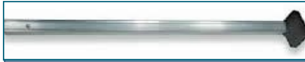
R045R Extension Tube with Articulating Foot